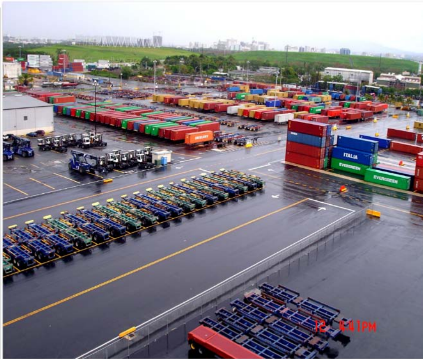
Piers M, N and O